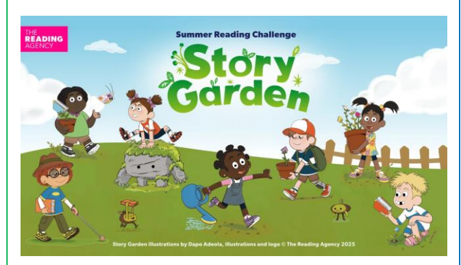
Sign Up - Read Books - Earn Rewards!