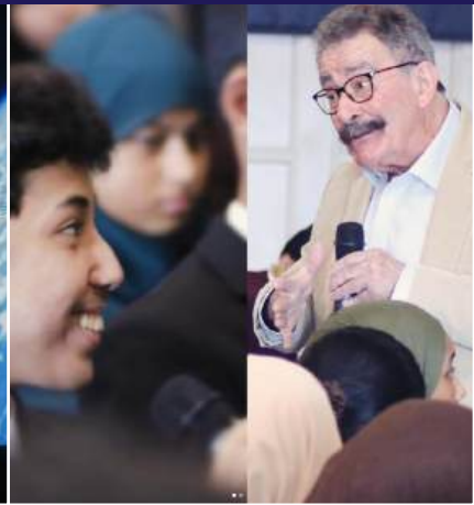
Lord Professor Winston