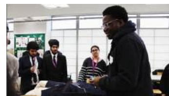
Bioengineering Outreach from Imperial College

We also welcomed, Havelock, Clifton, Wolf Fields St Anselm's and Featherstone Primary Year 6 pupils to work with our 6th Formers and Science teachers.