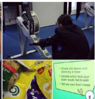
Staff from Elevation X led the "What is a Watt?" Workshop