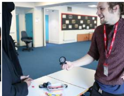
Hands on Science challenged our students to a race, Newton style!