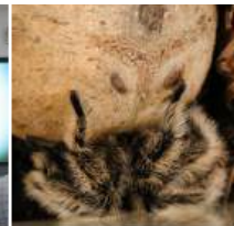
The Zoolab creatures