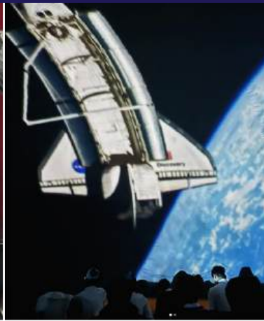
The Mobile Planetarium