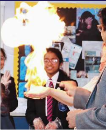
Hands on explosive science show!