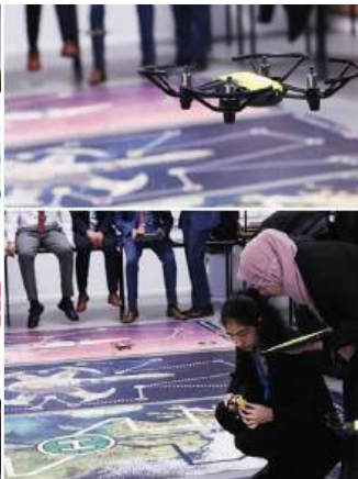
Drone coding workshop