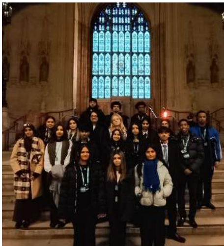
Sixth form students visit the House of Commons.