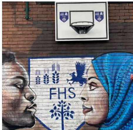
The playground hoops have had a face-lift: fresh paint and logos to brighten them up. Thank you to the Facilities Team.